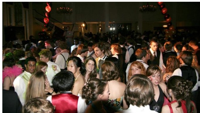
The dance floor

After dinner, it's finally time to go to prom. At smaller schools prom is held in the school gym, but I think many schools hold prom in hotel banquet rooms or wedding reception halls. DJs play the latest hits, and students hit the dance floor. There is no formal ballroom dancing; students dance however they like. Many students worry about not being a good dancer, but nowadays with YouTube, they can practice some moves at home beforehand. Teachers monitor the dance floor to make sure there is no inappropriate behavior.