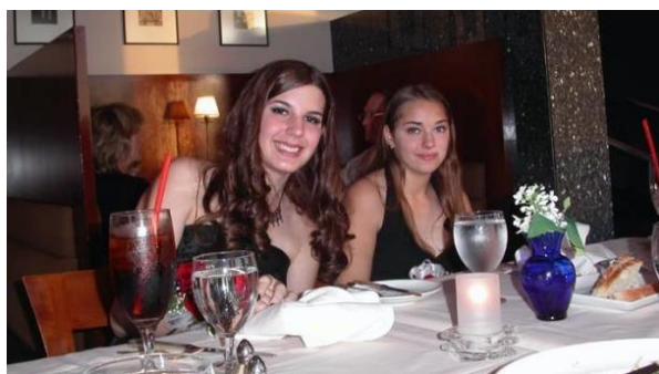
My best friend and me

So with my date and ride set, I headed to the mall with my mother to buy a prom dress. I chose a dress in my favorite color: black. I told my classmate that I wanted a red rose corsage, and I got him a white rose boutonniere. I had my hair curled at the salon on the day of the prom, and I did my own makeup. It was the first time I ever put on false eyelashes. My best friend came over in the evening, and together we waited for the boys to arrive. They picked us up in a huge SUV.