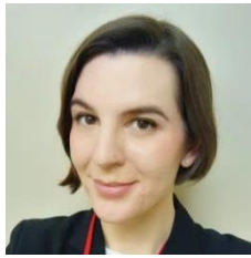
By Krystal Sato