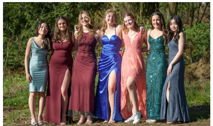
Girls in prom dresses

Once you have a date, you have to decide what you're going to wear. Boys rent suits or tuxedos, while girls buy dresses. Prom dresses can be expensive, and sales start around January or February. Normally couples coordinate their attire for a cohesive prom look.