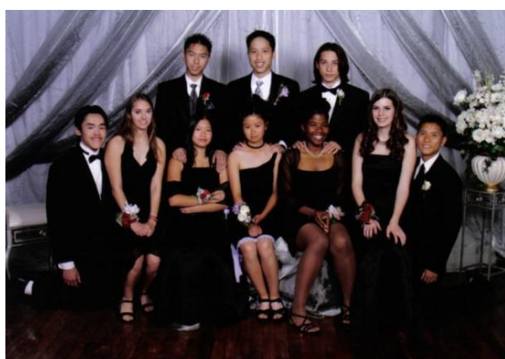
My prom group photo. I don't know why all the girls wore black.

The four of us met up with other classmates at a restaurant, and we had a wonderful dinner. Once we arrived at the prom, we took photos and hit the dance floor. The room was dark and the DJ booth was lit up with neon lights. I danced a lot. There were many tables and chairs near the dance floor, and there were plenty of soft drinks available. My friends and I socialized there while taking breaks between dances.