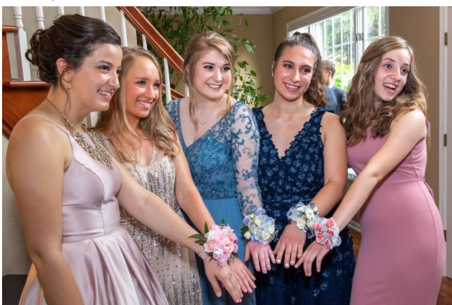
Girls showing off their corsages

At the girl's house or at the arranged meeting place, promgoers exchange corsages and boutonnieres. It's like a ritual. Bouquets are traditional gifts for a date, but since they get in the way when dancing, boys generally give girls a corsage when going to prom. It's made from fresh flowers and is worn on the wrist like a bracelet. Girls then give their date a boutonniere, which is a flower that is pinned to the lapel of the boy's jacket. The color and type of flower used for the corsage and boutonniere are coordinated between the couple ahead of time. And of course parents ask the happy prom couples to pose for tons of pictures!