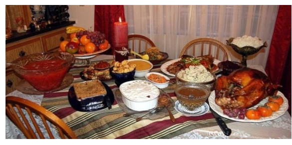
A typical Thanksgiving dinner

Thanksgiving customs are very similar between the US and Canada. The most important thing is the Thanksgiving meal. The menu has remained largely unchanged from olden times, and features many ingredients native to North America. First of all, the turkey is the star of the show. In fact, many people call Thanksgiving "Turkey Day." If you have a big family, it's common to serve a ham as well. Also, if you have vegetarian or vegan relatives, you have to serve them something meatless, such as a "tofurkey" (tofu turkey). The standard side dishes are mashed potatoes and gravy, stuffing (made from bread, vegetables, and herbs, and often stuffed inside the turkey and cooked), sweet potato casserole topped with marshmallows, green bean casserole, Brussels sprouts, creamed corn, corn bread, and cranberry sauce. The most popular dessert is pumpkin pie, but apple, sweet potato, and pecan pies are also common.