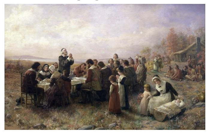
Jennie Augusta Brownscombe, The First Thanksgiving at Plymouth, 1914

Thanksgiving is a harvest festival held in both America and Canada. For Americans, the holiday is just as big as Christmas. This month, I'm going to introduce some of the history and customs of Thanksgiving.