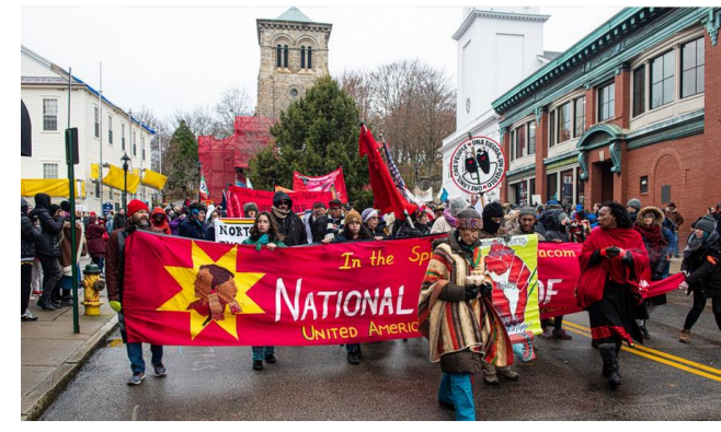
National Day of Mourning protest held on Thanksgiving

Indigenous peoples have suffered so greatly? It is necessary for us to reflect on the crimes of the past, learn more about Indigenous peoples' history and culture, and have respect for the Indigenous peoples of the Americas while cooperating for the future. In addition, we need to stop idealizing the romanticized myth of the first Thanksgiving, and give thanks for the truly important things in life, such as our family, friends, and good health. \bigstar